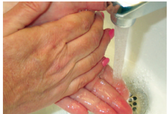
Your eye health is important - don't take shortcuts

Correct hygiene is of prime importance. Before handling the lenses be sure to wash your hands.