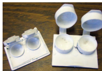
Dirty cases are a source of contamination and infection

Most solutions include a disposable case with each bottle. Discard the old case each time you open a new bottle.